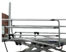
Foldable Side Rails