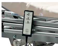
Hook on Control