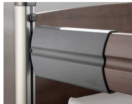
Sophisticated technology and the perfect look: the telescopic side rail for standard and special lengths