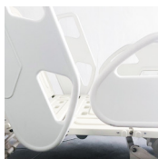
Closer Side Panel