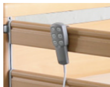
Hook on Control