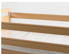
Closer Side Rails