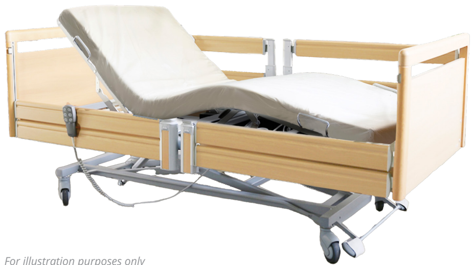
For illustration purposes only