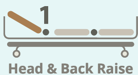
Head &amp; Back Raise