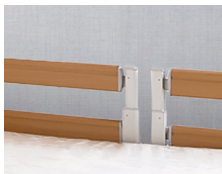
Closer Side Rails