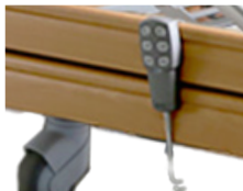
Hook on Control