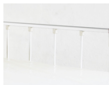
Closer Side Rails