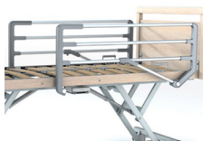
Foldable Side Rail