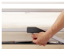
Rail Release Knob