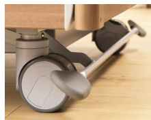
Central Braking System